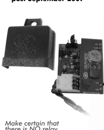
NOVA VOYAGER receiver pre September 2007

Make certain that there is NO relay on the board to confirm type of Rx