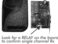
Single channel NOVA receiver

Look for a RELAY on the board to confirm single channel Rx