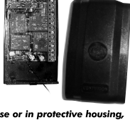
Multichannel NOVA receiver

Receiver may be mounted loose or in protective housing, internal or external to the operator