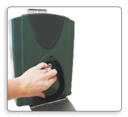
7. Return the cover to the operator and clip into place. Return the manual release thumbwheel to the 'locked' position

Lock the cover in place using the camlock key supplied with the operator.