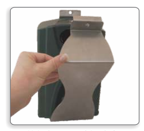
8. Fold the front strap of the Theft-resistant Cage up and over the unit so that the 10mm holes on the tabs line up.

Lock the cover in place using the camlock key supplied with the operator.