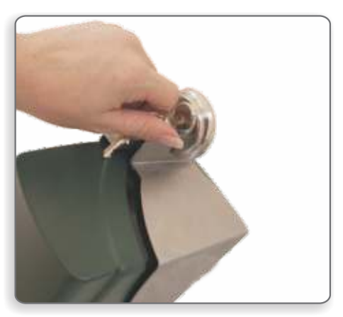
Place the discus type padlock (not included in this kit) through the holes to lock the Theft-resistant Cage straps together.