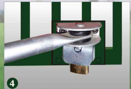
4 Fully installed Padlock Shield.