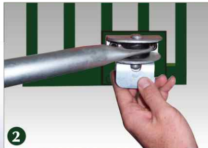
2 Place Padlock Shield over pin