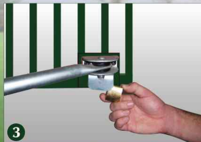
3 Fit Padlock through Padlock Shield and pin.